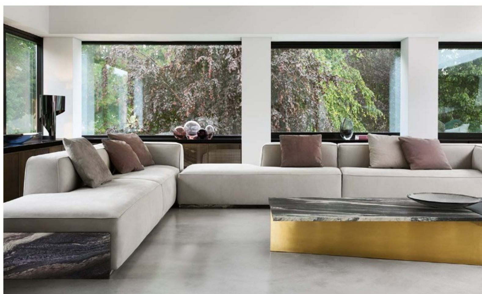
Terrae sofa & Delos coffee table, design Draw Studio - NEUTRA showroom, Birago

Next in the large living space come the new proposals created by Draw Studio of Luca Martorano and Mattia Albicini : on one side, the visionary and impressive Islas table formed by two distinct parts in mixed Cipollino marble; on the other, the rigorous Terrae modular sofa, in which a marble shell forms a contrast with the abundant, welcoming upholstery, and the Delos coffee tables with a metal base and a top available in marble or leather.