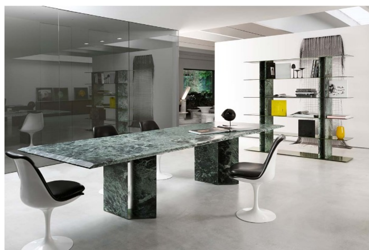
Adym collection, design Gabriele & Oscar Buratti - NEUTRA showroom, Birago

Passion, creativity and sartorial expertise are the values that become tangible in the pathway through the different areas. At the entrance of the first floor, the Adym collection by Gabriele & Oscar Buratti welcomes visitors with a sculptural table and a bookcase in Verde Alpi marble. The table brings out the poetry of the natural stone with doubled legs connected by metal details, while the bookcase is characterized by a system of thin aluminium tops, supported by double marble bases, which can be composed with extreme freedom to create solutions of different levels and organise spaces in different and articulated ways.