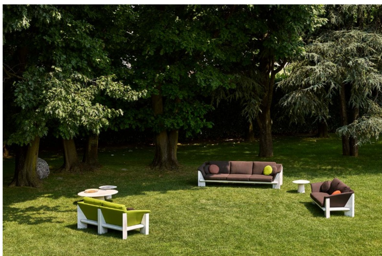
La Grande Muraglia Outdoor collection, design Mario Bellini - NEUTRA showroom, Birago