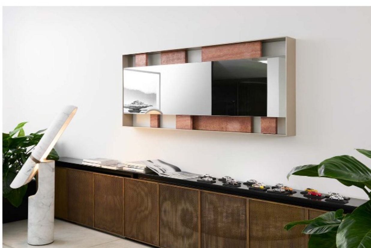
Dima mirror, design Migliore+Servetto - NEUTRA showroom, Birago

NEUTRA collections stand out for their exclusivity and refinement, the result of complex workmanship and effective measures for personalization. Every piece bears witness to mastery and innovation, characterized by carefully selected materials and unique details that convey a sense of timeless elegance. These top-quality creations, which also include limited edition collections, have been developed to respond to the needs of a sophisticated clientele with refined tastes. All the proposals express timeless elegance and are the result of a heritage of over 140 years boosted by the driving force of the entry in the management of Emanuele Chicco Busnelli , the son of Piero Ambrogio , the historic founder of B&B Italia .