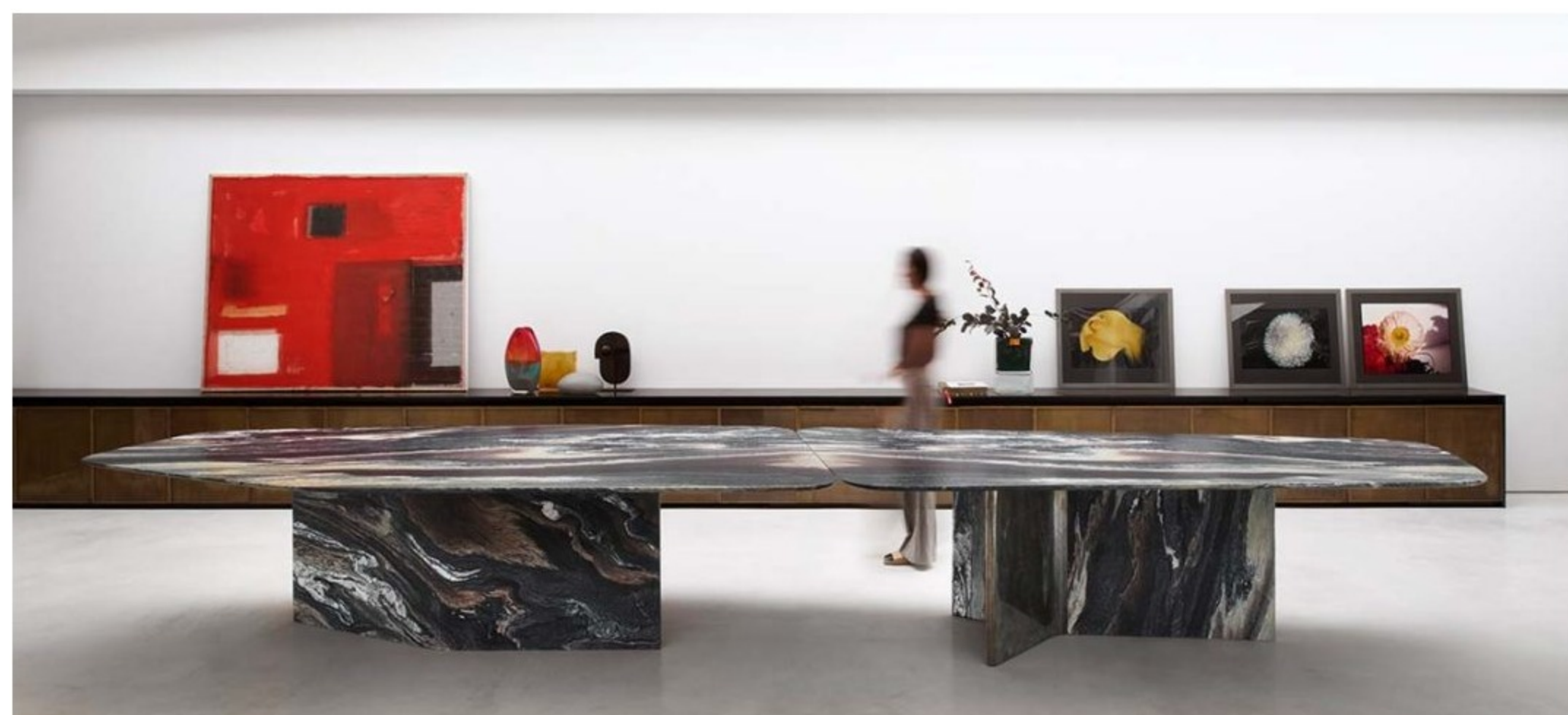
Islas table, design Draw Studio - NEUTRA showroom, Birago