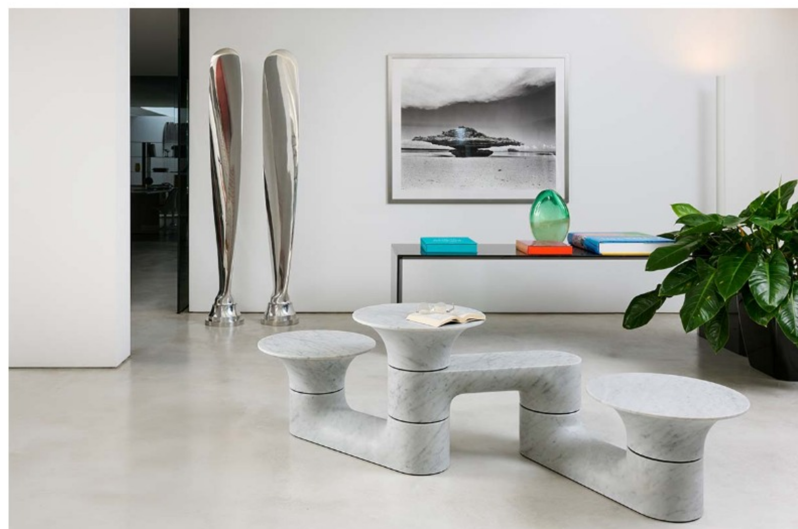
Micelio modular system, design atelier oï - NEUTRA showroom, Birago

The journey continues in the area set aside for the creations of atelier oï , the Swiss design studio founded by Aurel Aebi , Armand Louis and Patrick Reymond , with the Micelio modular low table system and the Révérence family of table and floor lamps. On the wall, the Dima mirror in aluminium and salvaged marble, designed by the studio Migliore+Servetto , plays with 3D effects.