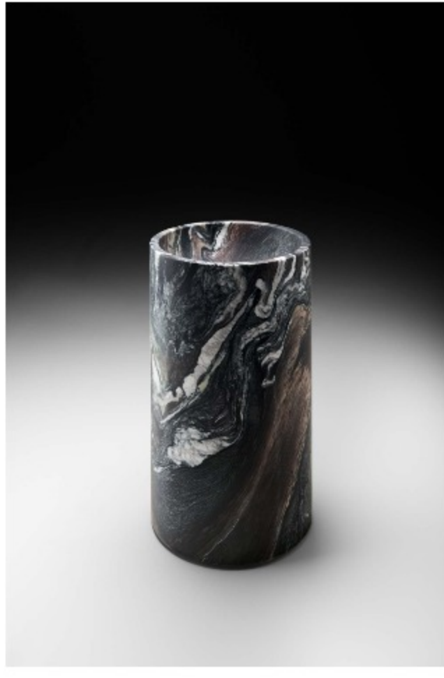
Minimal M6 by NEUTRA, design Nespoli e Novara