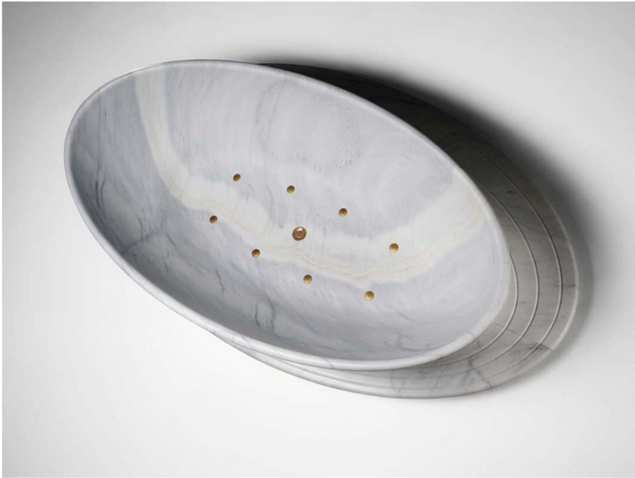
Palma by Neutra, design Foster + Partners