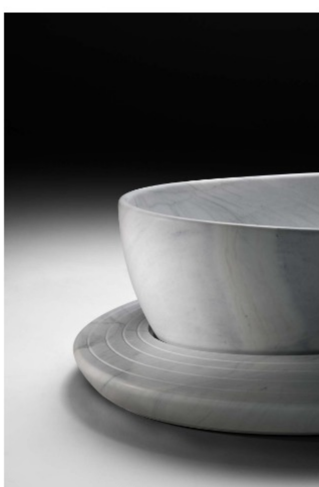
Palma by NEUTRA, design Foster + Partners

A four-handed job to create a series of furnishings, including a bathtub, washbasin and suspended shelf in an elegant Bianco Covelano, directly inspired by the architectural form of the Palm Flower. The absolute star is the bathtub, carved from a single block of marble and integrated into the architecture: it resembles a petal floating on the water, with its fluid lines and smooth contours, on the borderline between work of art and functional object.