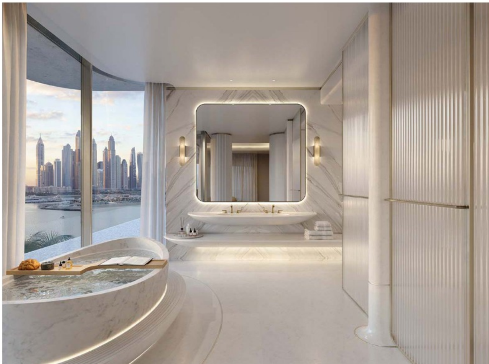
Palm Flower, Palma Jumeirah, Dubai

Aesthetics therefore go hand in hand with versatility, so NEUTRA's expertise is declined on different scales, as much in the product as in the project. This is why the brand was chosen by the renowned Foster + Partners studio to execute the bathroom space designs for the 11 flats of the 'Palm Flower' luxury residential building that will rise on the 'trunk' of the Palm Jumeirah in Dubai.