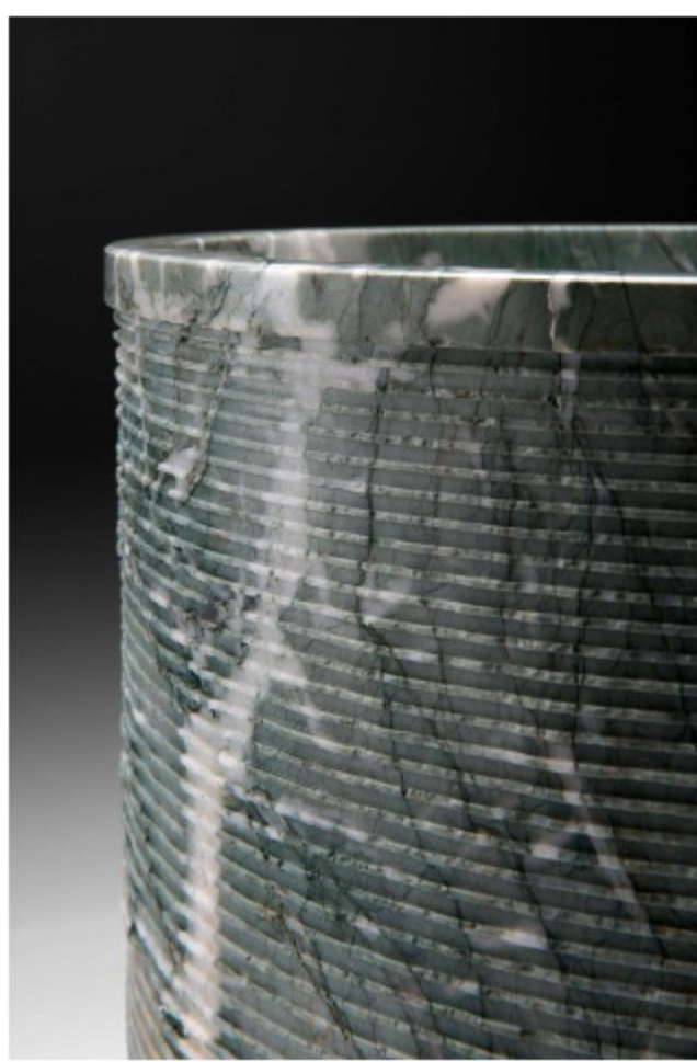
Minimal M6 by NEUTRA, design Nespoli e Novara