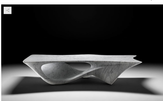
Zaha Hadid Architects Present Erosion Collection

Zaha Hadid Architects, renowned for their avant-garde approach to architecture and design, presented their latest masterpiece, the Erosion Collection , in Milan this week. Collaborating with Neutra, the collection delves into the interplay between materiality, time, and form. At the heart of this collection are the Minera Table and Branch Console , two pieces that not only redefine furniture but also celebrate the beauty of natural stone transformed by the passage of time.