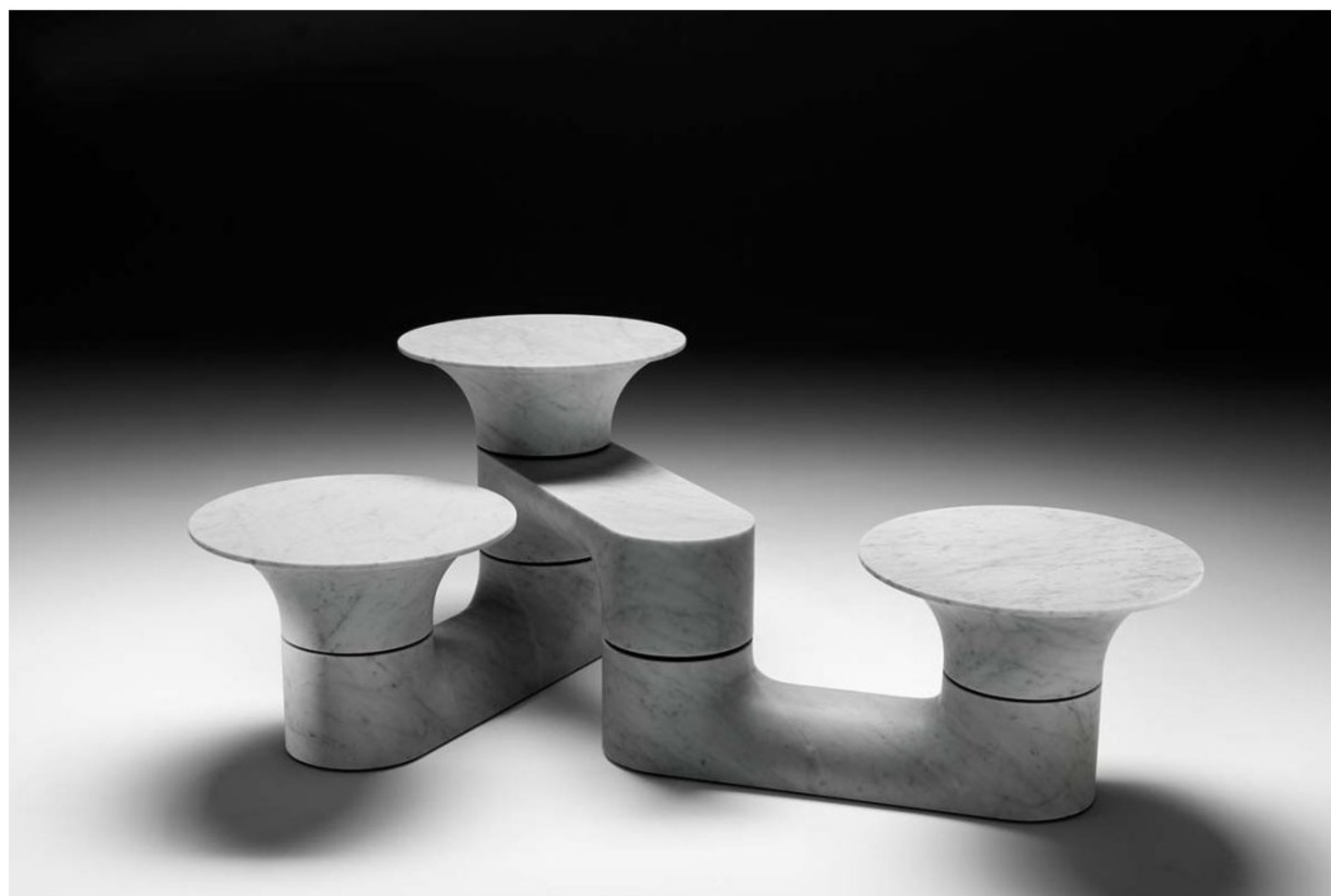
Micelio by Neutra, design Atelier oï

Matter as you've never seen it. NEUTRA's intention is to overturn the point of observation. Indeed provide a totally unique and unprecedented one. A physical and virtual journey directly into the body of marbles, stones and metals to grasp their unknown qualities and value, transferred inevitably into the brand's furnishings by the creativity of its designers. It is with this innovative mode that NEUTRA presents its new collections during Milan Design Week 2024, within the equally innovative MEET Digital Culture Center, the International Center for Art and Digital Culture recognized as a museum by Regione Lombardia.