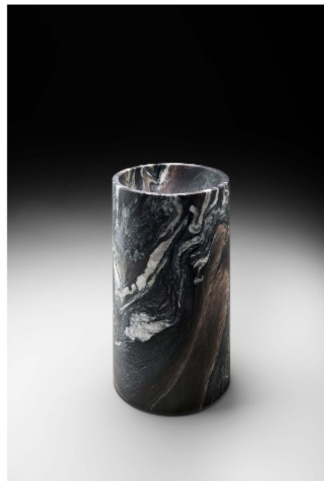
Minimal M6 by Neutra, design Nespoli e Novara