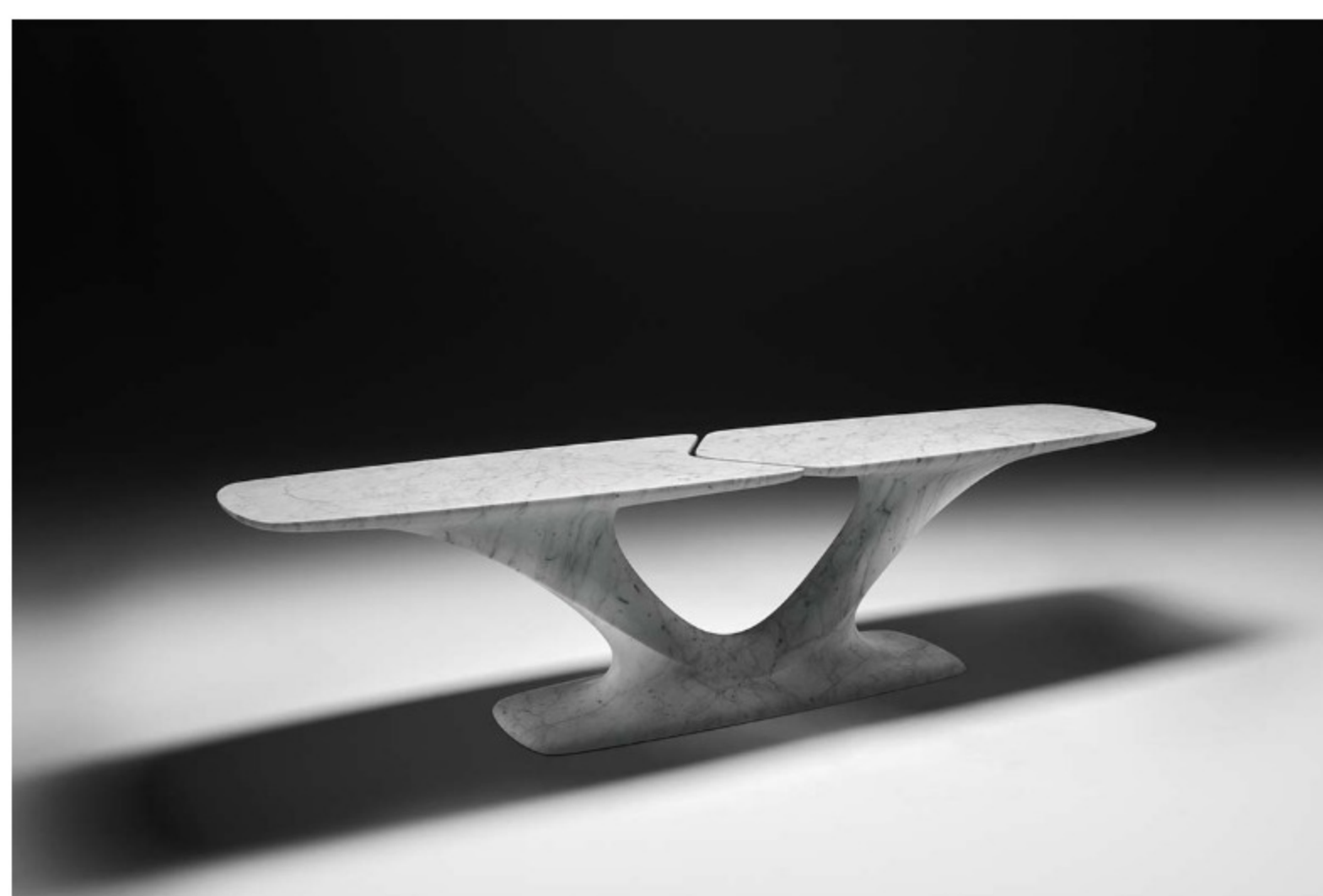
Branch by Neutra, design Zaha Hadid Architects

It begins, on the ground floor, with a dynamic overview dilated on 9 screens, focusing on fragments and details of the material that accompany Erosion Collection by Zaha Hadid Architects: the Minera table and Branch console, both carved from a single piece of Carrara marble, celebrate the fluid forms that express the natural effect of erosion, masterfully shaped by delicate workmanship.