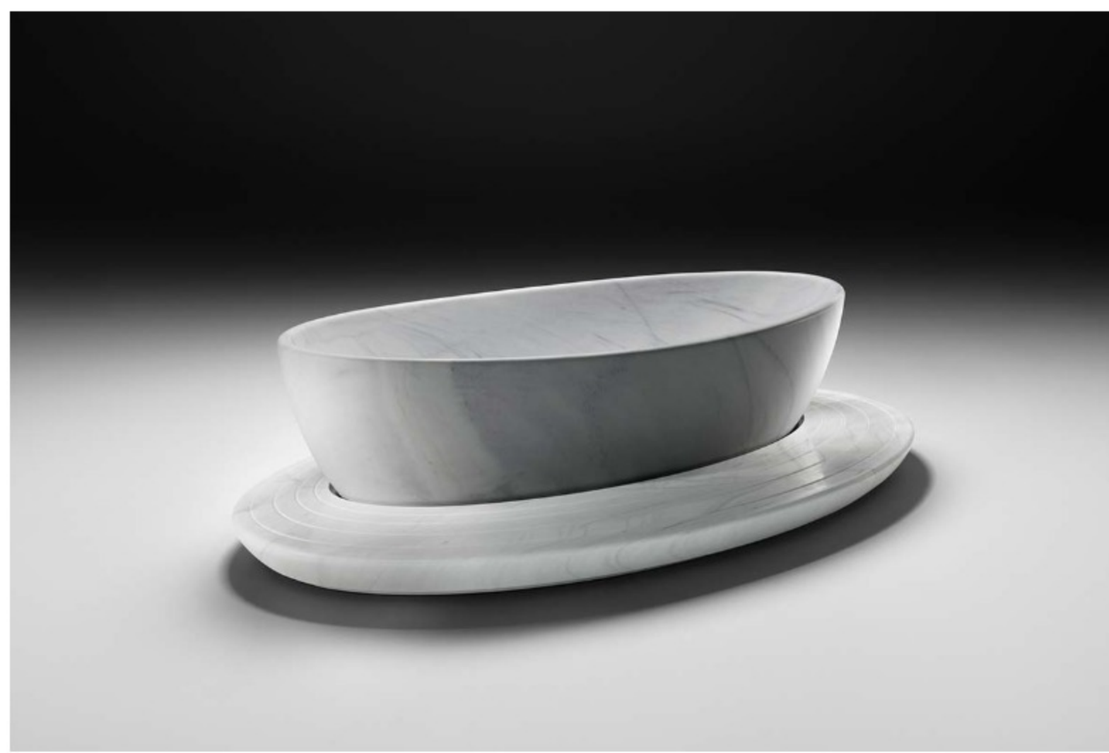
Palma by Neutra, design Foster+Partners

There are also the Dima, Viviera and Cavo mirrors by Migliore+Servetto, which alternate marble with metal in a reflective play emphasized by integrated light; and also the preview revelation of NEUTRA's collaboration with the prestigious international firm Foster + Partners, which has selected the company as a partner to create marble elements for the new project residential Palm Flower in Dubai.