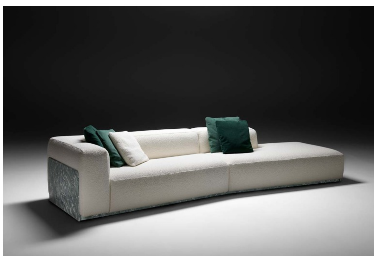
Terrae by Neutra, design Draw Studio

On the first floor, the New Marble Landscapes gallery explores marble, layer by layer, in its organic permeability and introduces the unprecedented chaise-longue version of La Grande Muraglia, a collection of marble sofas and seating designed by Mario Bellini in 1981, made of Bianco Covelano marble.