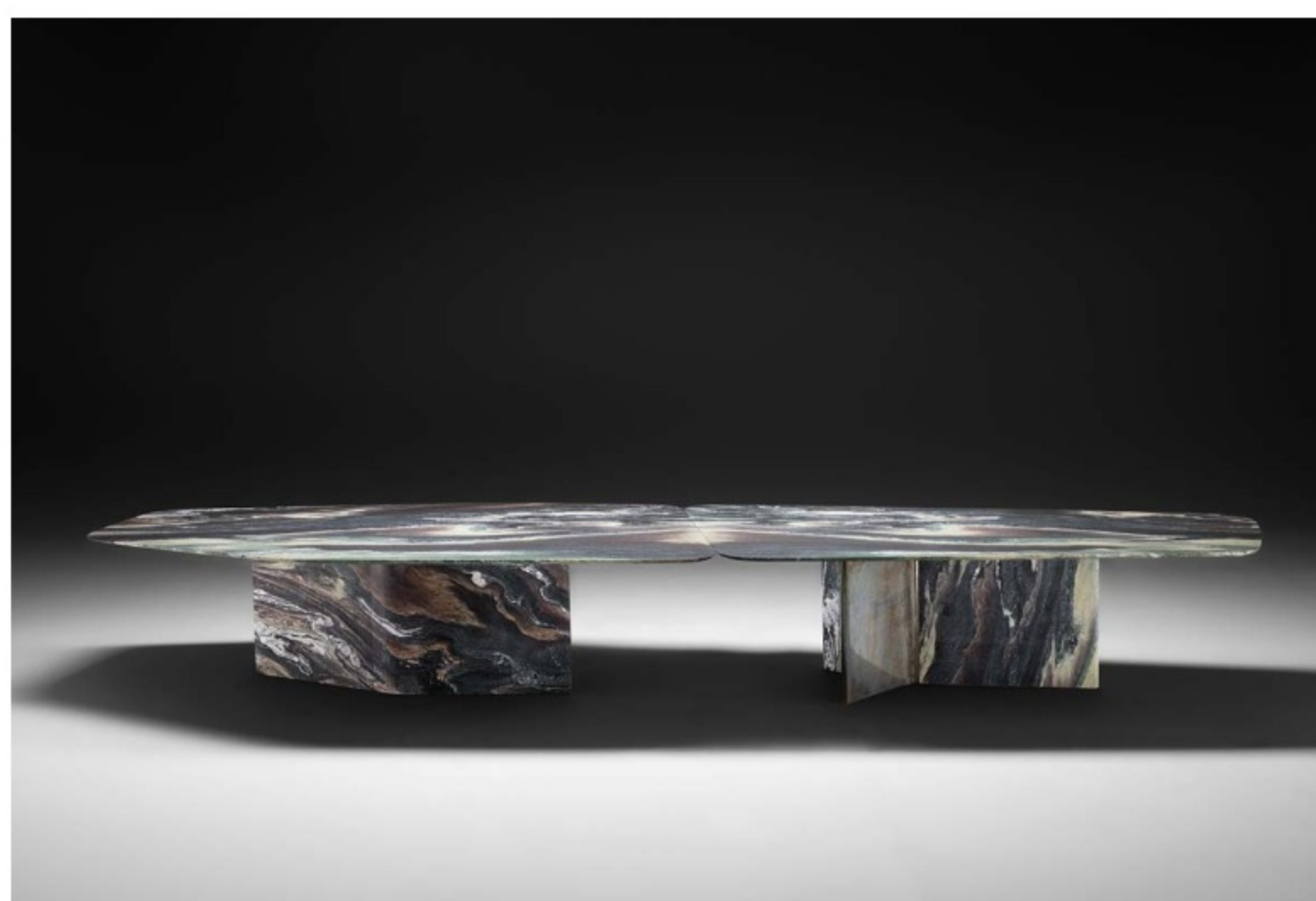
Islas by Neutra, design Draw Studio

The intricate installation 'To the edge of matter. An unforgettable journey' curated by Migliore+Servetto, art directors of the brand, introduces and accompanies the viewer along a landscape narrative that unfolds in five visual and aural scenarios. Here eight designers interpret the vision of the company with furniture for the living and bathroom areas.