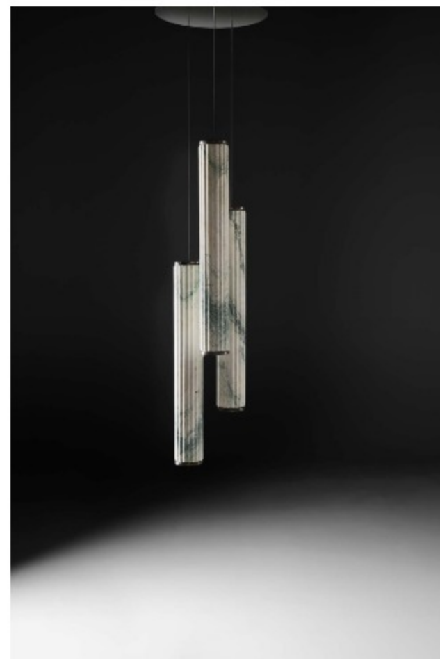
Eos by Neutra, design Draw Studio

In The mirroring effect, the play of reflections and reversals of perspectives, achieved with two inclined backdrops, is the backdrop for the Minimal M6 washbasin collections by Nespoli and Novara, whose shapes reinterpret the concept of the monolith. Finally, To the edge of matter, the culmination of the exhibition itinerary, opens onto a lunar landscape that dialogues with furnishings designed by Atelier oï - Révérence lamp and Micelio low table system, both relating to duality - and Draw Studio - Islas table, Eos lamp, Terrae modular sofas, Delos side tables. A system sound designed ad hoc with sound artist NEUNAU helps give voice to the material.